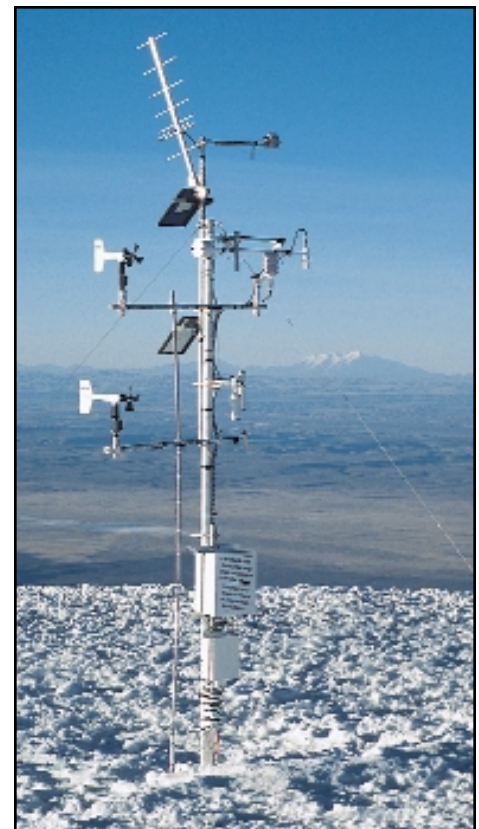
The Nevado Sajama weather station measures a variety of meteorological and snow parameters, many redundantly, to ensure data capture and integrity.