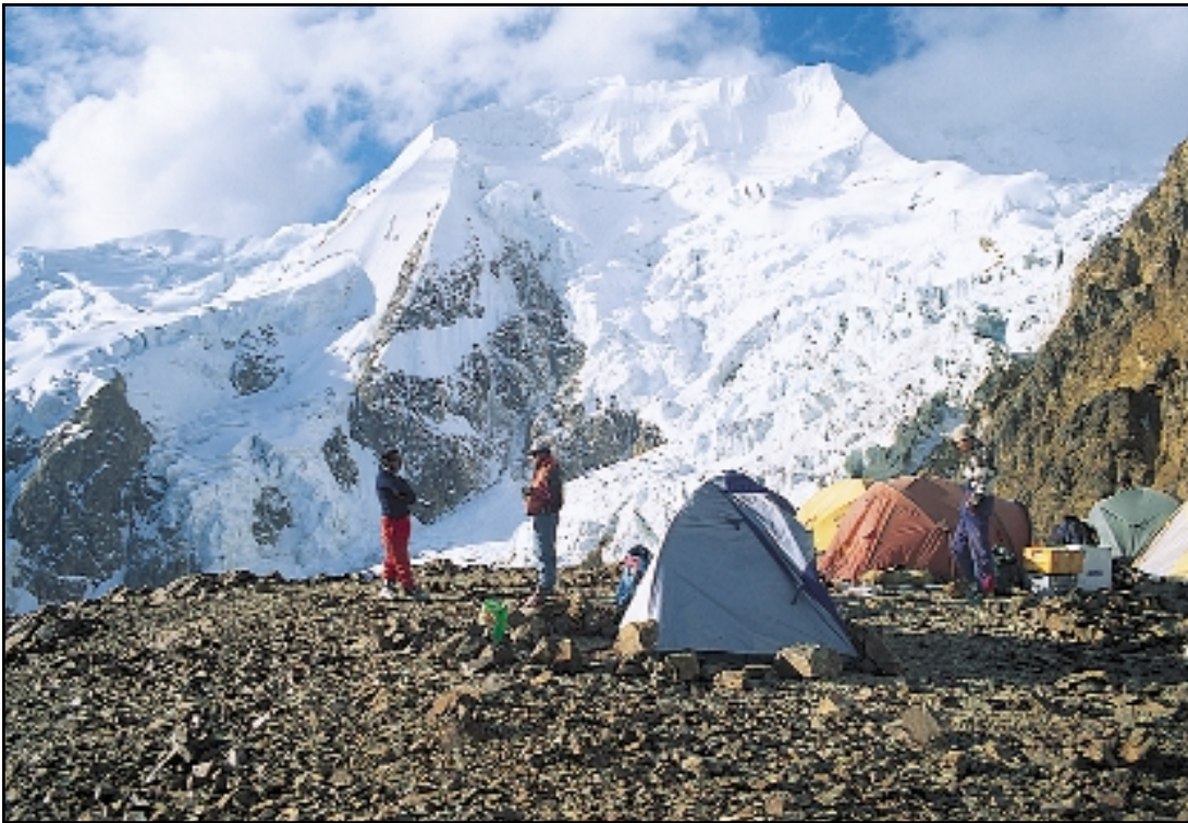
High camp, or 'Nido de Condores' on Nevado Illimani sits at approximately 5,500 meters (18,045 ft). The Illimani summit looms in the background.