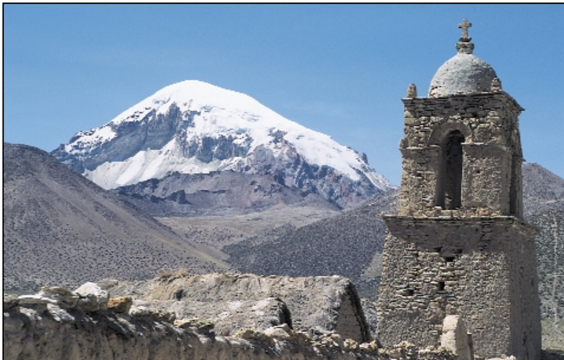
Framed by a church built c. 1886, Nevado Sajama (21,464 ft above sea level) rises behind the village of Sajama in western Bolivia. Ice cores taken from the summit detail global-scale changes in climate.

Tropical ice cores reveal global climate histories