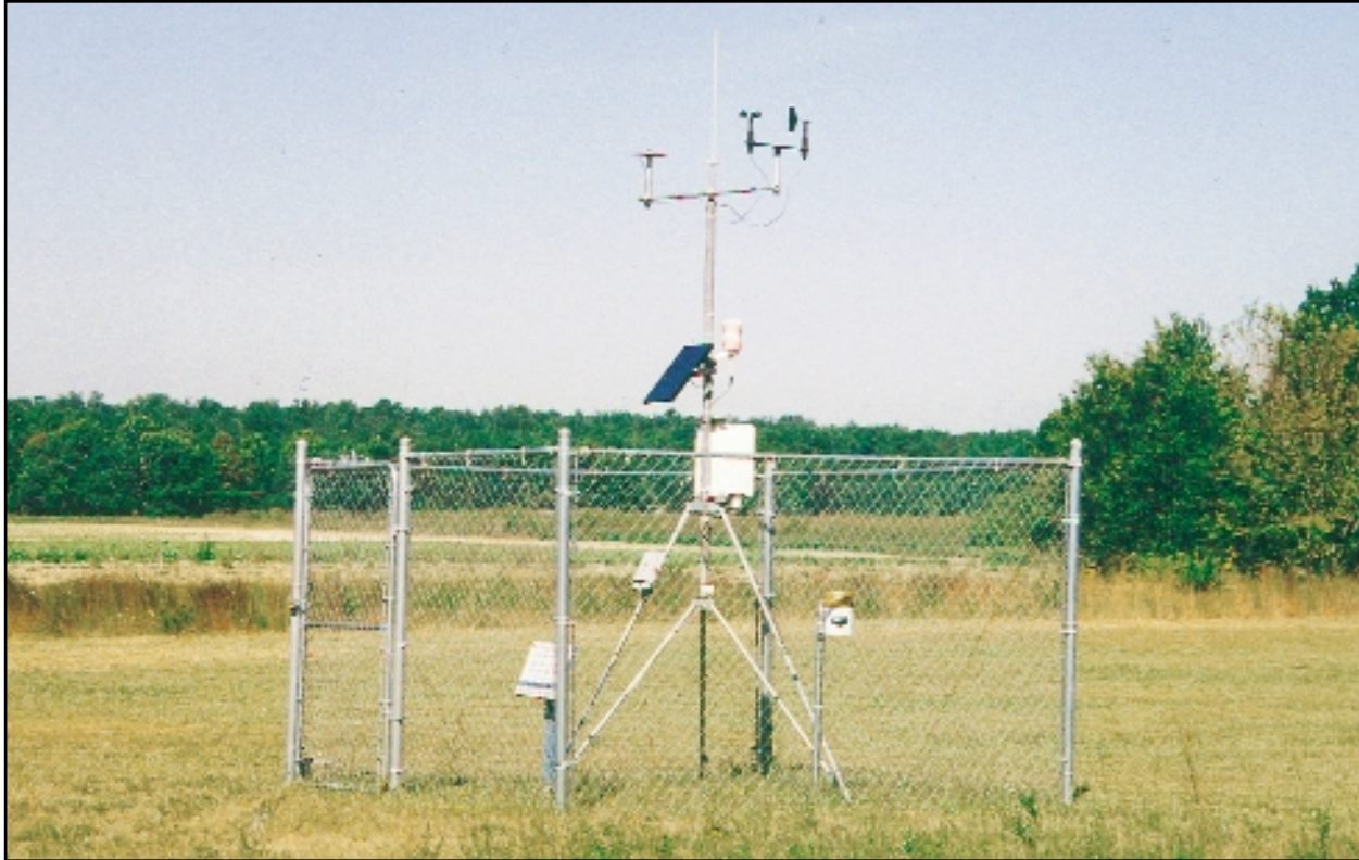
R.I.S.E. station sites provide ample room for wheelchair access and allow school children the opportunity to study the network.

CSI-driven 'R.I.S.E.' benefits homeowners, farmers, water managers and researchers