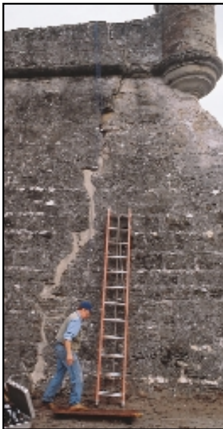
Sensors are installed across a crack in the southwest bastion.

Campbell Scientific equipment helps to preserve and restore an historic monument