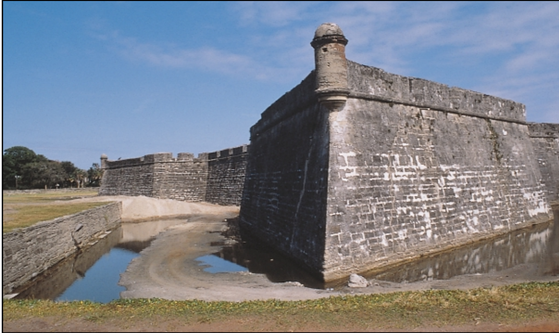
Castillo de San Marcos National Monument, St. Augustine, Florida. Taken in 1995, this view looks across the moat toward the southwest bastion, where several major cracks are visible.