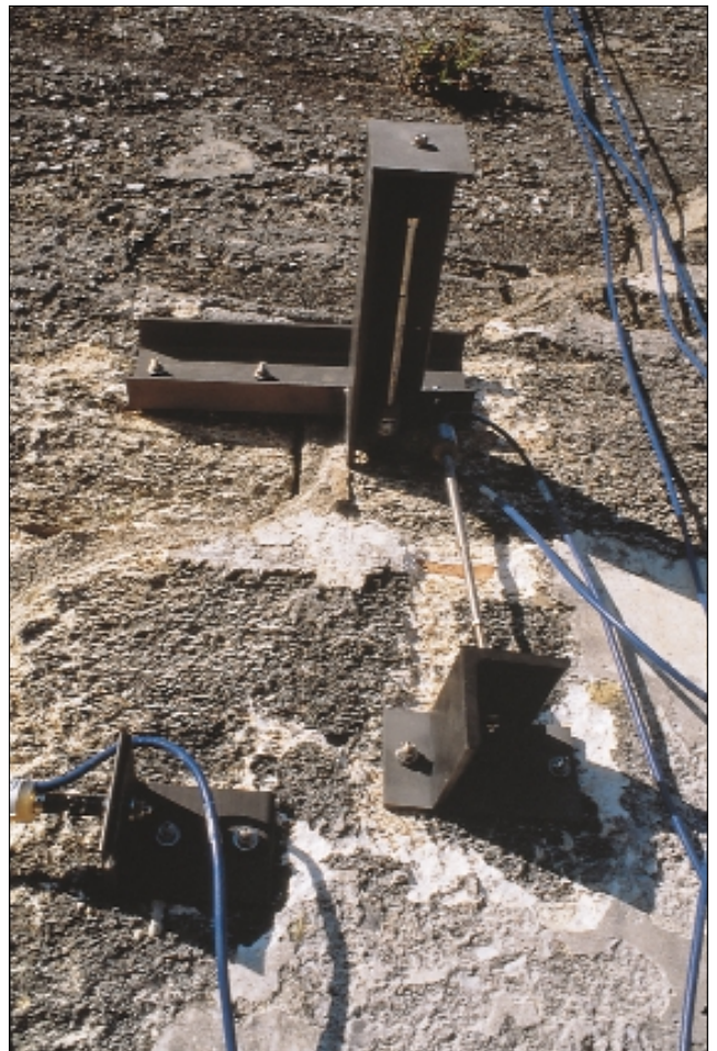
Sensors straddle cracks to directly measure displacement in each of three axes.

Campbell Scientific provided the datalogger, multiplexers, weather stations, and soil moisture probes. The equipment was integrated with crack and tilt sensors.