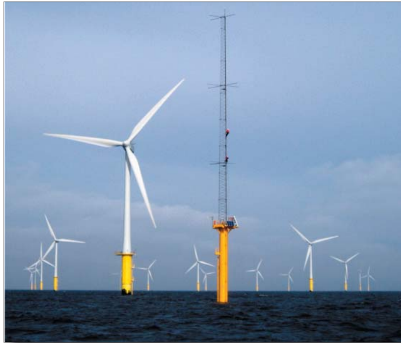
A Campbell Scientific datalogging system monitors this offshore wind farm located between Rhyl and Prestatyn in North Wales at about 7 to 8 km out to sea (photo courtesy RADTech Ltd. UK).

Campbell Scientific offers data acquisition systems that monitor conditions at wind assessment sites, at producing wind farms, and along transmission lines. Key components include high-speed dataloggers, sensors, communications devices, software, and towers.