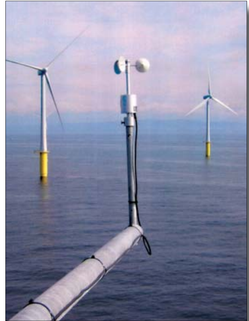
View from one of the anemometers on the meteorological tower to the monopiles and turbines of a wind farm.

IsoTruss (Brigham City, Utah) offers 50, 60, or 82 meter tilt-up towers. These towers are built from carbon fiber, which is very strong and lightweight. Wind sensors can be mounted anywhere along the length of the tower. Many sensor mounting options are available for IsoTruss, NRG, or non-guyed towers.