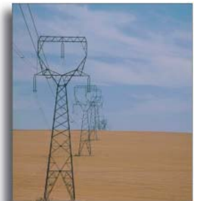
Hydroelectric, solar, and wind power generation plants use our systems.

Our dataloggers can be used for many different purposes. They can make and record measurements, control electrical devices, or both. Their multifaceted capabilities include functioning as PLCs or RTUs. They have many different channel types, allowing nearly all sensor types to be measured on a single unit. For example, one datalogger can measure voltage, solar radiation, temperature, and gas flow, while controlling a number of peripheral devices. Channel types include analog (single-ended and differential), pulse, switched excitation, and digital. Not only are there multiple types of input channels, but each of these channels can be independently programmed for various sensor types. Most sensors connect directly to the