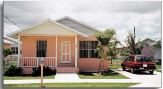
Energy research on 10 homes in Florida showed that air conditioning use increased 12% for each degree the thermostat was set below 81°F.