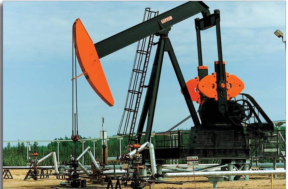
Wide operating temperature ranges, solar-, AC- or battery-powered operation, wireless communications, and reliable performance make our systems ideal for unattended monitoring.

Campbell Scientific's measurement and control systems provide reliable and versatile data collection at a variety of utilities and energy facilities. Whether your application requires long-term, remote monitoring, or monitoring and control based on complex logic, our systems provide accurate and reliable results. Our data acquisition systems monitor conditions at power generation plants (hydroelectric, solar, and wind), terminals, substations, oil and gas pumping facilities, commercial and residential consumer sites, and along transmission lines. Key components include dataloggers, sensors, and communications devices, which are customized for each application.