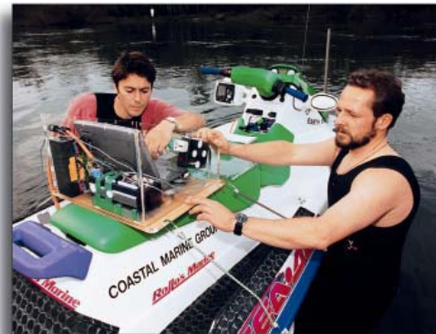
The goal of a research project in the Estuary of Auckland, New Zealand is to model the effects of cooling water discharges.