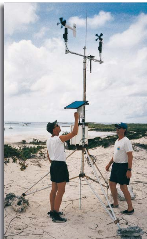
A weather station provides data for marine ecology research in the Bahamas.

Our PC-based support software simplifies the entire monitoring process, from programming and data retrieval to data display and analysis. Our software automatically manages data retrieval from networks or single stations. Robust error-checking ensures data integrity. We can even help you post your data to the Internet.