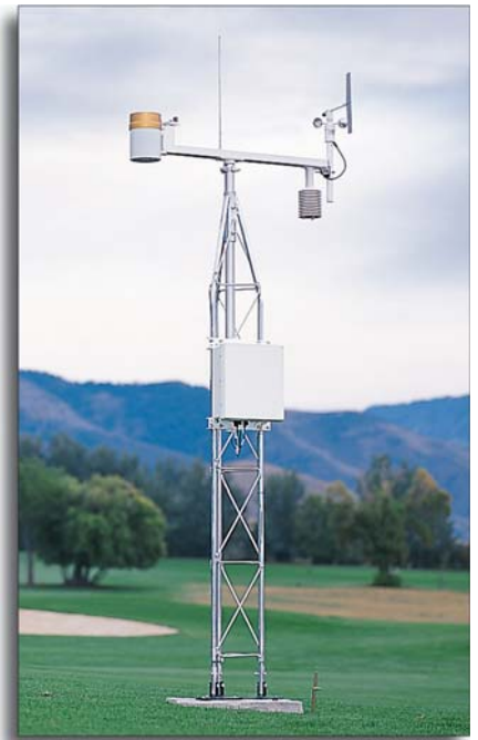
ALERT stations, hybrid ALERT stations, customized water quality/stage stations, and weather stations can all supply data to a LoggerNet-based system.

To meet customer needs, other resources and communications options can be combined with flood warning systems. Commonly, local governments will combine resources to obtain the best possible system. In other situations, federal agencies can be involved to increase system coverage and robustness, and even help with the budget. For example, GOES satellite transmitters can be added to stations to provide automated data archival through the National Weather Service (NOAA/NESDIS) and the US Geological Survey. Multiple purpose data collection systems bring to bear the resources and expertise of environmental data experts.