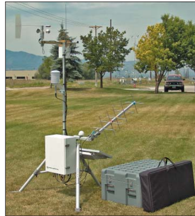
The components of a RAWS-F station fit inside of two optional carrying cases for easily transporting the station to the site.

Our RAWS-F Quick Deployment Station has metal connector caps that are chained to a connector panel. The connectors are color-coded, keyed, and labeled—simplifying the attachment of sensors. Four additional connectors can be incorporated into the panel.