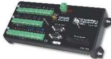
The versatility of our stations stems from the capabilities of our measurement system.

Campbell Scientific's RAWS-F Fire Weather Quick Deployment Station (at right) provides accurate measurements in harsh environments. These stations can be set up in less than 10 minutes—without tools.