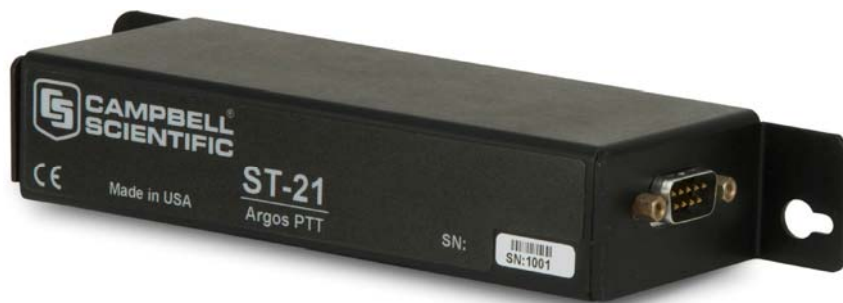
FIGURE 1-2. The ST-21's 9-pin Connector Attaches to the Datalogger via the SC12 Cable