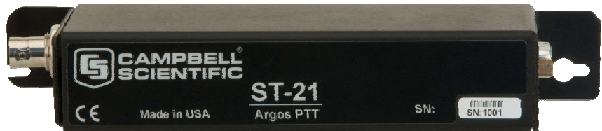
FIGURE 1-1. ST-21 Argos Satellite Transmitter

The ST-21 is a certified Argos PTT satellite transmitter for use with Campbell Scientific CRBasic dataloggers. Service Argos data transceivers fly aboard two NOAA polar orbiting satellites. With an orbit altitude close to 800 kilometers, the satellites are at a relatively low orbit. The low orbit allows for low transmit power, low battery power requirements and the use of an omnidirectional antenna. The orbit period is approximately 1 hour and 45 minutes, which allows hourly data at extreme northern and southern latitudes. Near the equator there are about six satellite passes per day that are not evenly spaced. During the average satellite pass, the satellite is in view for about 10 minutes.