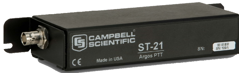
FIGURE 3-1. The ST-21's BNC Connector Attaches to the Antenna via the Antenna Cable

The ST-21's BNC connector is for attaching the antenna (see Figure 3-1).