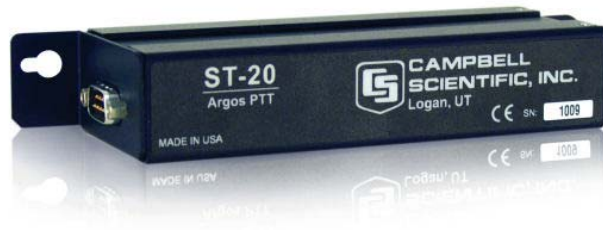
FIGURE 1-1. ST-20 Argos Satellite Transmitter

The ST-20 is a certified Argos PTT satellite transmitter for use with Campbell Scientific, Inc. CRBasic dataloggers. Service Argos data transceivers fly aboard two NOAA polar orbiting satellites. With an orbit altitude close to 800 kilometers, the satellites are at a relatively low orbit. The low orbit allows for low transmit power, low battery power requirements and the use of an omnidirectional antenna. The orbit period is approximately 1 hour and 45 minutes, which allows hourly data at extreme northern and southern latitudes. Near the equator there are about six satellite passes per day that are not evenly spaced. During the average satellite pass, the satellite is in view for about 10 minutes.