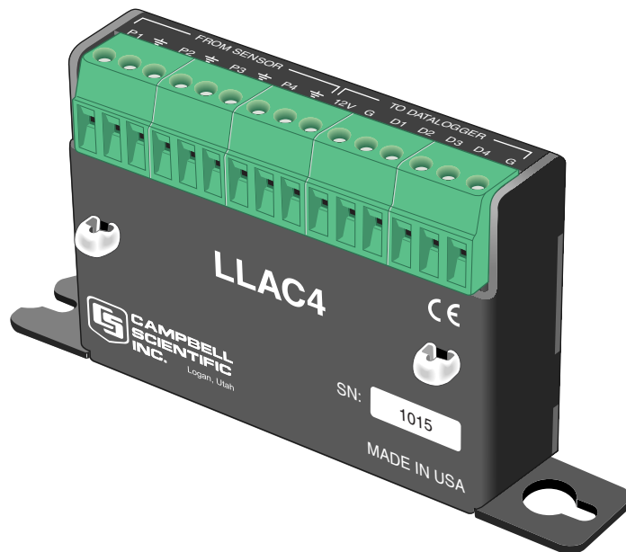
FIGURE 1. LLAC4 Four-Channel, Low-Level AC Conversion Module

The LLAC4 is often used to measure up to four anemometers, and is especially useful for wind profiling applications. Compatible wind sensors include, but are not limited to, the 05103 Wind Monitor, 05106 Wind Monitor-MA, 05305 Wind Monitor-AQ, 03001 Wind Sentry Set, and 03101 Wind Sentry Anemometer.