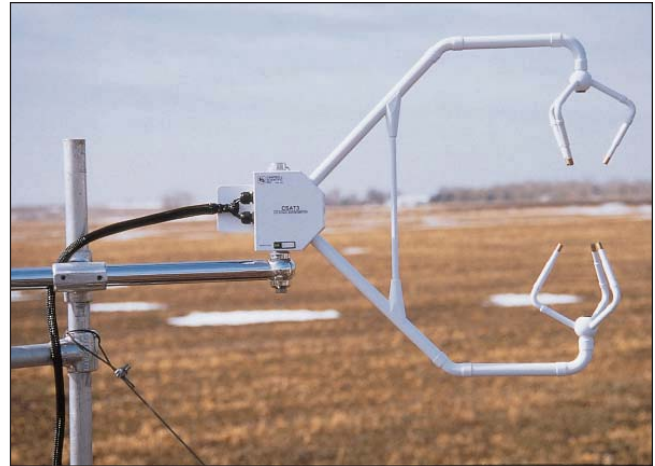
The CSAT3, shown making measurements over a fallow field in Minnesota, provides precision turbulence measurements with minimal flow distortion.

The SDM protocol supports a group trigger for synchronizing multiple CSAT3s. The FW05 fine wire thermocouple (12.7 \mu\text{m} diameter) is available as an option for fast response temperature measurements.