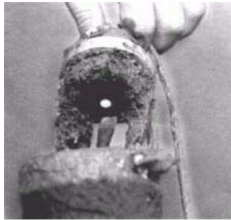
FIGURE 4-1. Preventing Bio-fouling of the CS510-L

O 2 probes require a minimum water velocity across their membranes to function properly. Therefore, to measure DO in stagnant water conditions, it is necessary to move the water past the membrane to get accurate and reliable DO measurements. In many instances the water also has a high bio-loading and the probes become fouled resulting in inaccurate DO measurements.