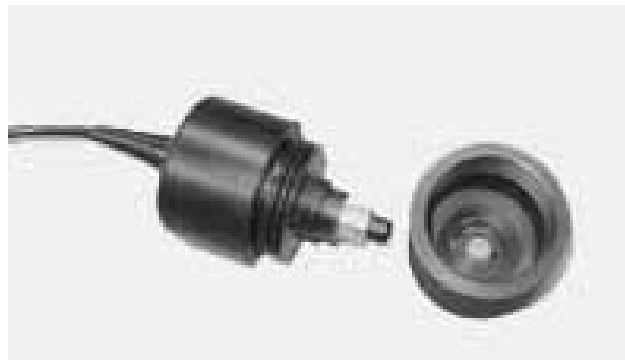
FIGURE 1-1. CS511-L

The probe's robust construction and simple design make maintenance and servicing it straightforward. There is no need to send the probe back to the factory for servicing. It utilizes a strong, easy-to-clean and easy-to-change membrane in a screw-on membrane cap. Regular servicing is not required. When necessary the probe can be fully overhauled in five minutes.