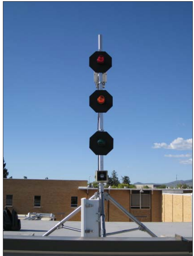
Logan High School in Logan Utah has installed a lightning warning system that includes the CS110. The CS110 is mounted to a CM110 10-ft stainless-steel tripod that sits on a roof next to the football field (left). Lights included in the system indicate the likelihood of lightning (right).