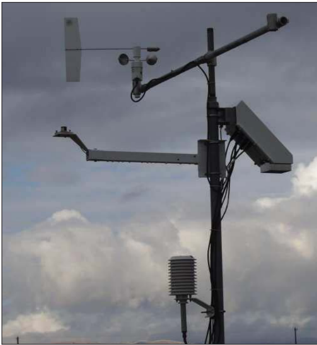
The CS110's internal datalogger can measure additional meteorological sensors—making the CS110 the center of a full weather station.