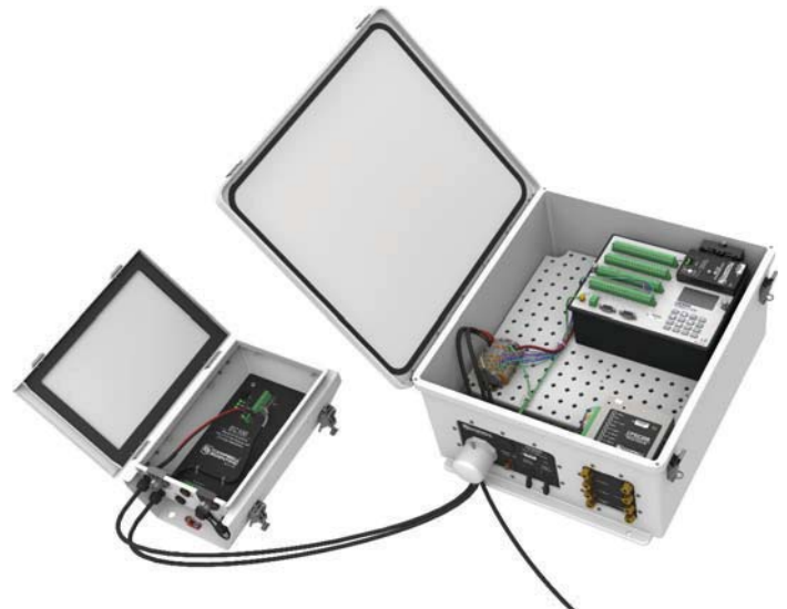
Figure 4. EC100 electronics connected to the CPEC200 system enclosure.

26511 EC155 chemical bottle assembly. Two bottles are included.