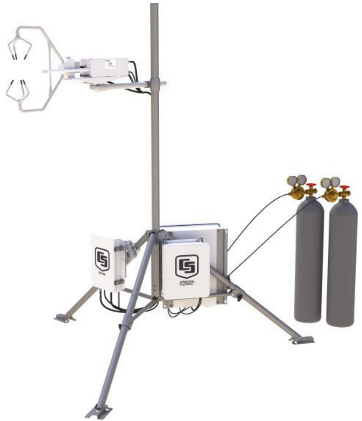
Figure 1: CPEC200 Closed Path Eddy Covariance Flux System.