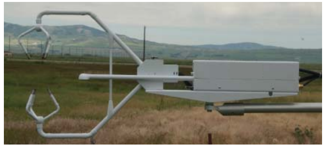
Figure 2: EC155 gas analyzer with CSAT3A sonic anemometer.