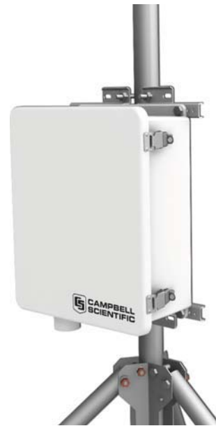
An enclosure mounted to the mast of the CM106.