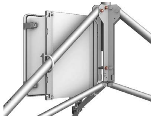
Back of an enclosure mounted to the leg base of the CM106.