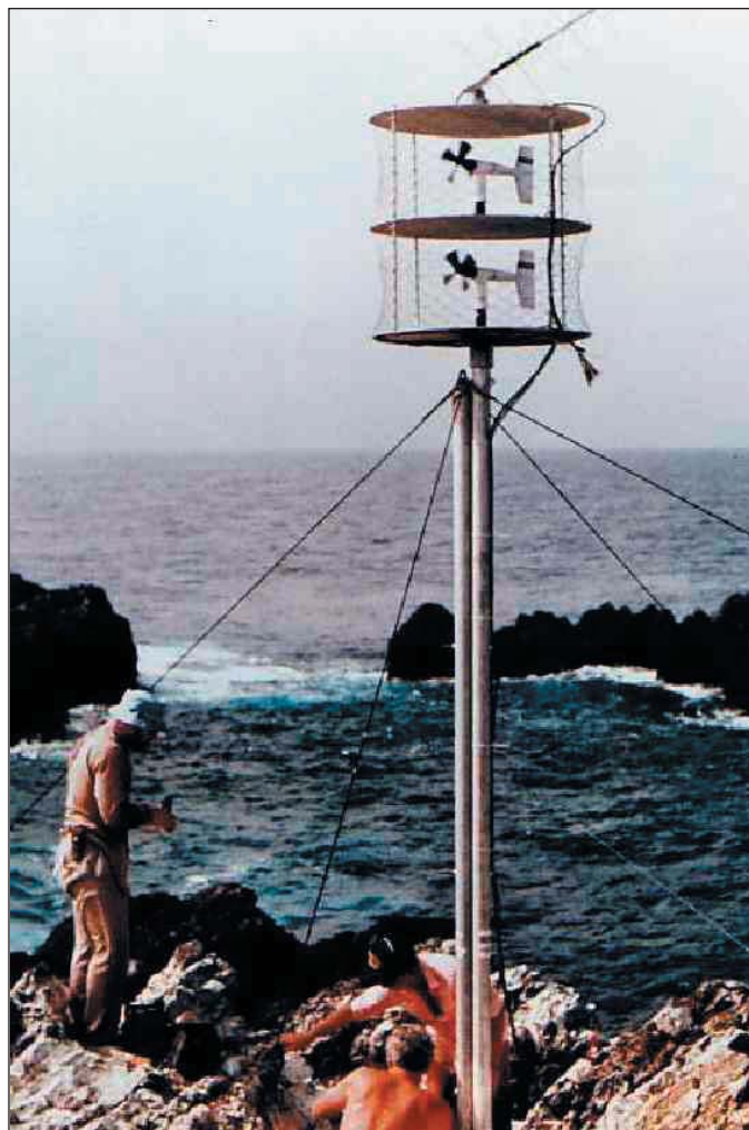
An innovative method of discouraging interference from birds is shown in this photo of a wind measurement station at St. Peter and St. Paul Rocks (Brazil). The station was located in the mid-Atlantic during the SEQUAL (Seasonal Equatorial Atlantic Experiment) field program.