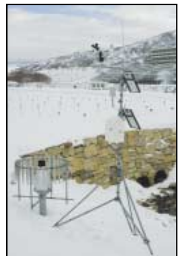
A station stands at Soldier Hollow Stadium, venue for the biathlon, all cross-country skiing events and the nordic combined.

Managed by the Salt Lake Organizing Committee