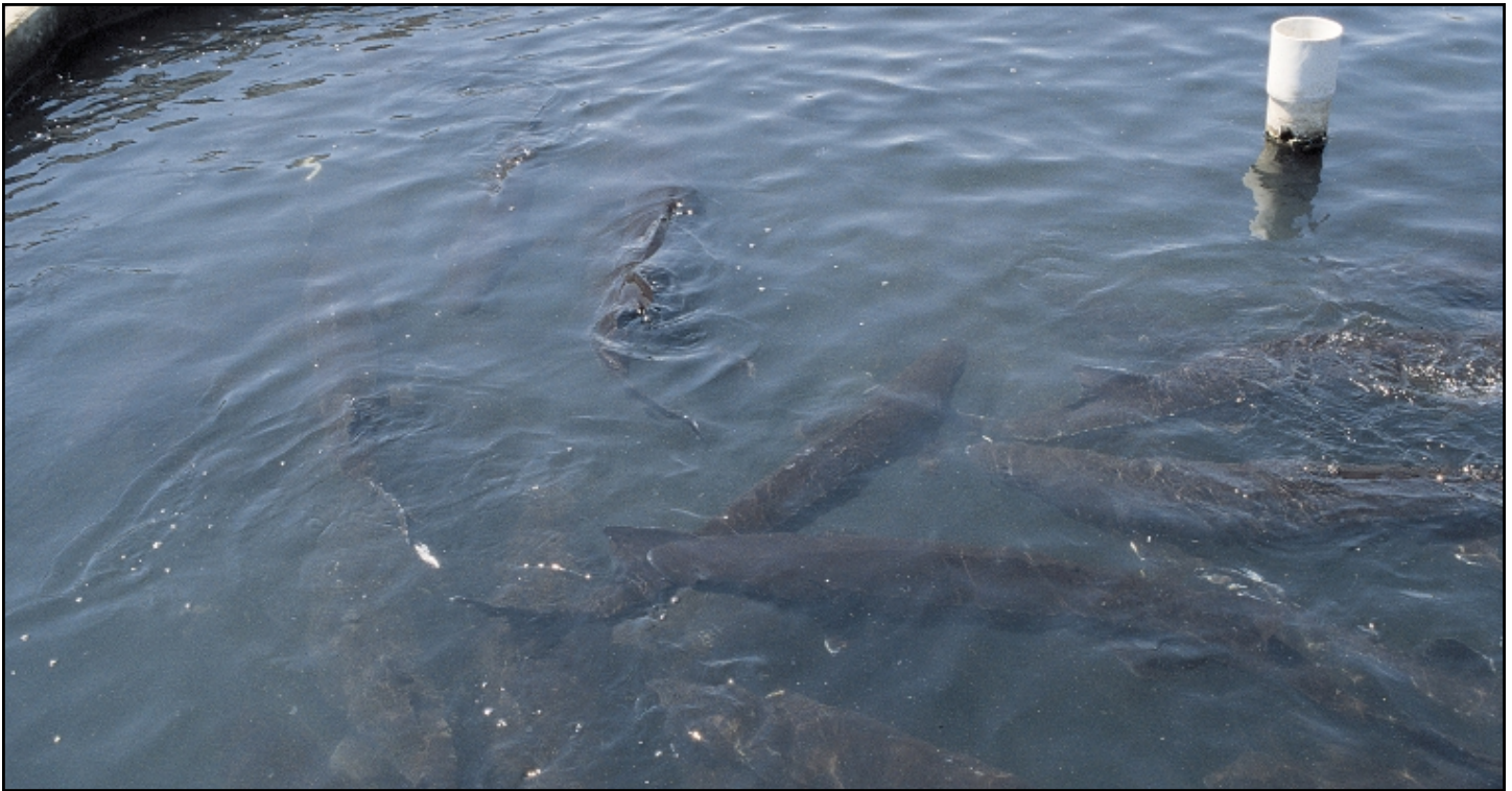
Sturgeon, raised from eggs, spend eight to 10 years in monitored Stolt Sea Farm tanks before roe is processed into caviar for a world market.