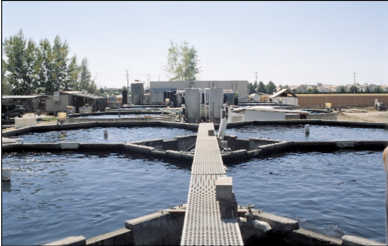
A Campbell Scientific system continually monitors and controls water quality in each of 12 individual tanks at the Stolt Sea Farm facility in Elk Grove, California. The tanks house sturgeon, raised to produce premium caviar.

With perfection as the rule, caviar producer turns to CSI