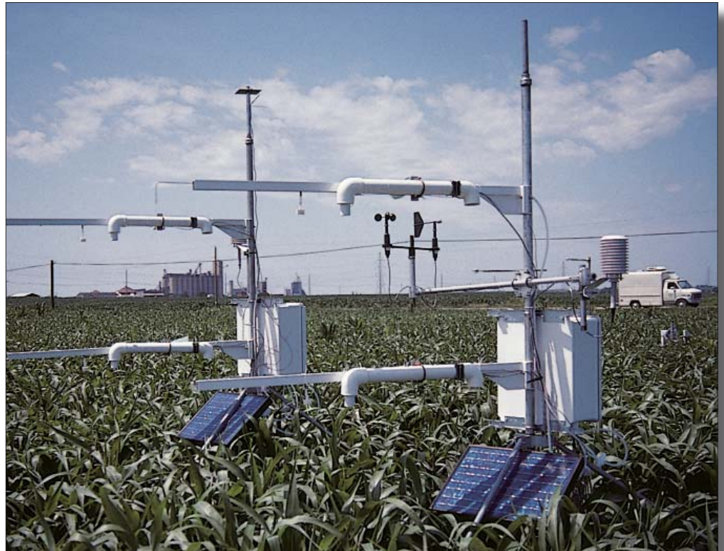
Two Bowen ratio systems calculate evapotranspiration and CO 2 fluxes over a sorghum field near Lincoln, Nebraska.

Campbell Scientific measurement systems are used extensively by agronomists, crop scientists, and soil scientists in agricultural research applications. Our measurement systems feature reliability, accuracy, and the flexibility to measure nearly any parameter. Typical systems include weather/evapotranspiration stations, CO 2 and water vapor flux measurement systems, and systems for monitoring soil parameters.