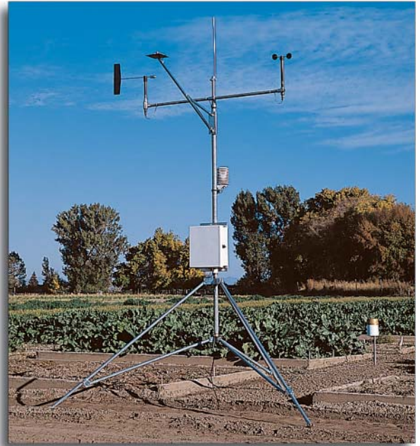
Many researchers place a weather station adjacent to test plots for a continuous record of meteorological conditions that could impact their research.

We offer multiple communications options for data retrieval; options can be mixed within the same network. Telemetry options include telephone (landline, voice-synthesized, cellular), radio (UHF, VHF, spread spectrum), multidrop, short-haul, Ethernet, and satellite. On-site options include storage module, PDA (requires PConnect or PConnectCE software), and laptop computer.