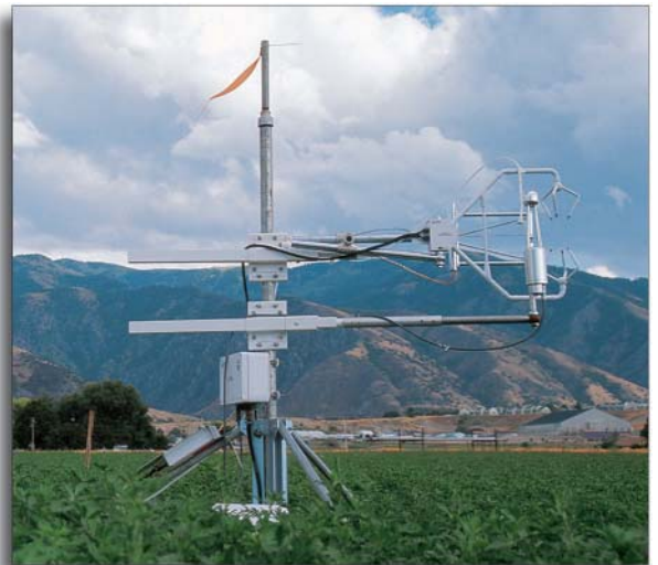
An integrated eddy covariance station monitors CO 2 and water vapor fluxes over an alfalfa field.