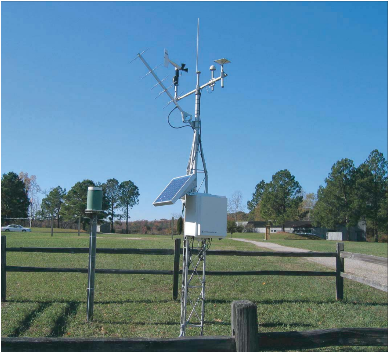
The National Estuarine Research Reserve (NERR) in Virginia uses a UT10 tower to support their meteorological sensors, solar panel, environmental enclosure, and antennas.

The UT10 is used as a sturdy, long term instrument mount for a variety of applications. It can be augmented with mounts (e.g., CM204, CM220, CM225) that allow attachment of meteorological sensors such as wind sets, pyranometers, and temperature/relative humidity probes. Other meteorological sensors such as barometers, soil temperature and moisture probes, and rain gages can also be used with a UT10-based station.