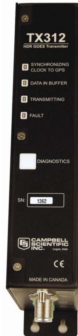
FIGURE 3-1. TX312 Label

drop, keep the battery power leads short. A five-foot power lead is a long power lead. If you must have a longer lead, use heavy wire. For power leads less than ten feet but more than five feet, use no smaller than 18 AWG.