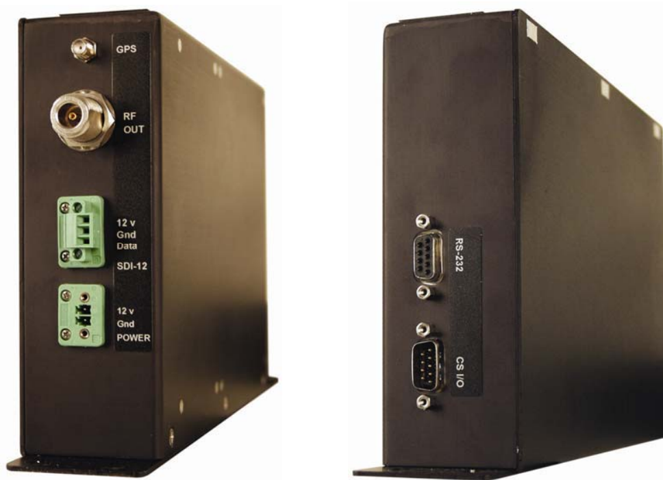
FIGURE 3-2. TX312 Connectors