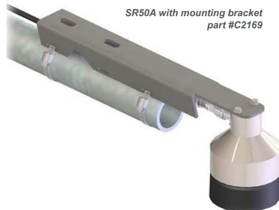
SR50A with mounting bracket part #C2169

An optional stainless steel chassis is available in sensor models SR50A-316SS and SR50AT-316SS. The stainless steel chassis is meant to operate in environments where corrosion is a concern (ie. marine).