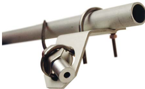
FIGURE 3-2. SI-111 Mounted onto a CM204 Crossarm via the CM230