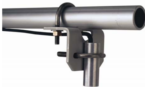
FIGURE 3-1. SI-111 Mounted onto a CM204 Crossarm via the CM220

The SI-111 is often mounted to a CM202, CM204, or CM206 crossarm, a tripod or tower mast, or a user-supplied pole via a CM220 right angle mount (see Figure 3-1) or CM230 adjustable inclination mount. The CM230 allows the sensor to be pointed at the surface of interest. When using the CM230, fix the declination of the sensor by tightening the u-bolt that mounts on the mast or crossarm. The inclination is then adjusted with the other u-bolt and nuts (see Figure 3-2). A hole threaded for a standard tripod camera mount screw (1/4 inch diameter; 20 threads per inch) can be used to mount the sensor to a user-supplied support.