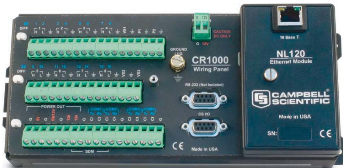
The NL120 fastens to the peripheral port on a CR1000 (shown above) or CR3000 datalogger.