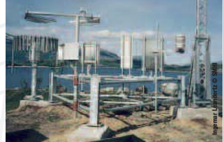
Stora Sjöfallet, Sweden