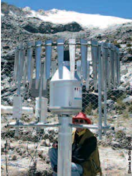
Charquini Glacier 4800m, Bolivia