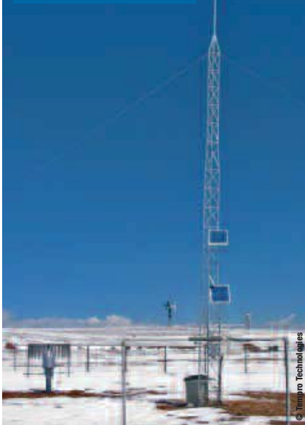
Quinghai Province, China