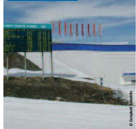
Salt Lake City, UT, USA