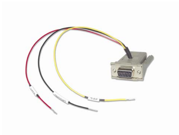
FIGURE 4. RJ45 to DB9 Serial Adapter, Part Number L17218