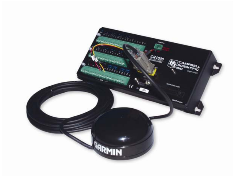
FIGURE 3. CR1000 to GPS16X-HVS Using the L17218 Adapter