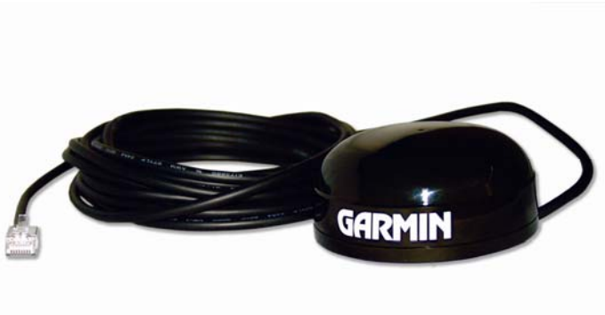
FIGURE 1. GPS16X-HVS GPS Receiver