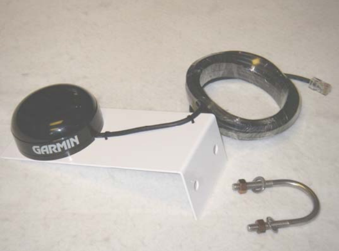
FIGURE 5. GPS16X-HVS Receiver Mounting Kit, Part Number C1737