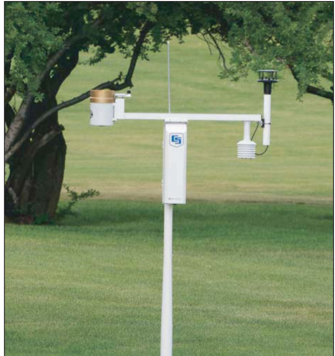
The ET107 provides real-time weather measurements and calculates ET o on an hourly and daily basis.

The ET107 can be programmed in minutes using VisualWeather software (requires version 3.0 or higher). VisualWeather software supports programming, manual and scheduled data retrieval, and report generation. The software also includes on-board equations that calculate ET o , crop water needs, growing degree days, wet bulb temperature, dew point, wind chill, and chill hours.