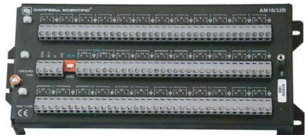
Multiple sensors can be measured by connecting the probes to an AM16/32B multiplexer and then connecting the multiplexer to the A547 interface.