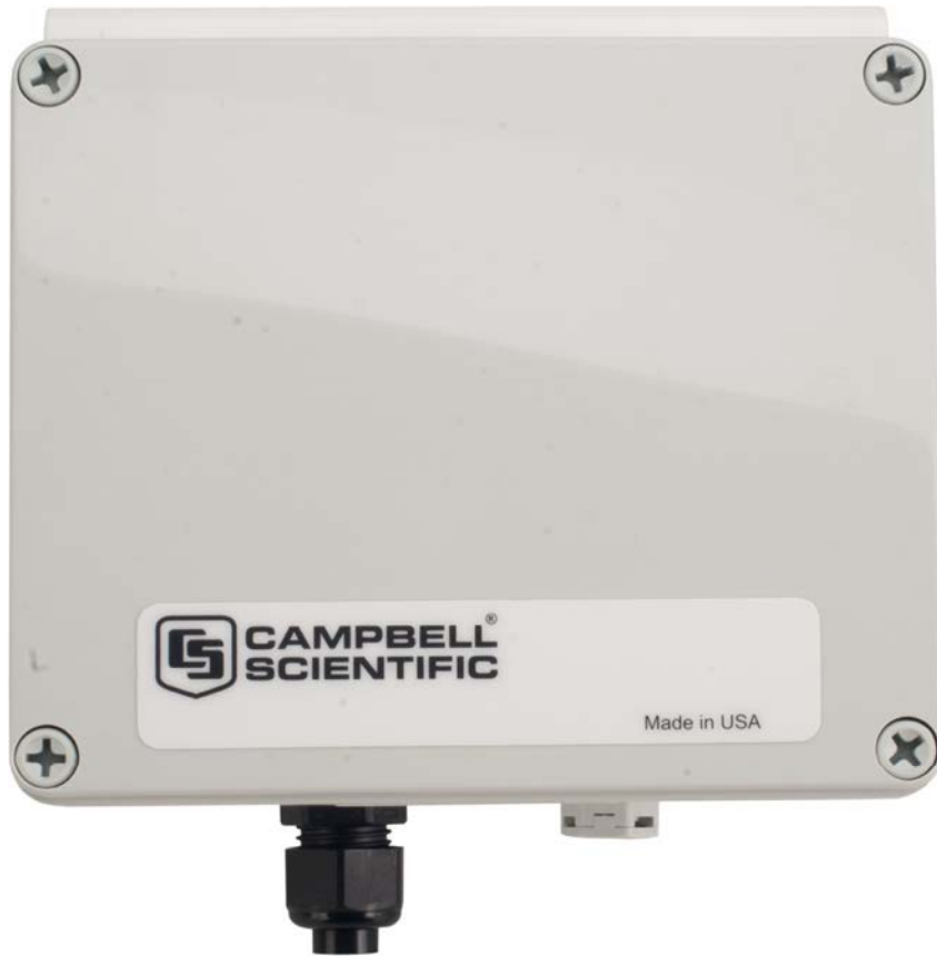
FIGURE 3-1. ENC100 is a very small enclosure that can house one CS100.

Remember that for the sensor to detect the external ambient pressure, the enclosure must vent to the atmosphere (i.e., not be hermetically sealed). Enclosures purchased from Campbell Scientific properly vent to the atmosphere.