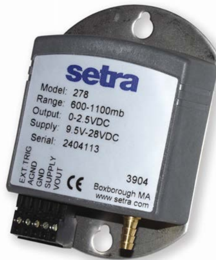
FIGURE 1-1. CS100 Barometric Pressure Sensor

Other measurement range options such as 500 to 1100 millibar, and 800 to 1100 millibar are also available. Please contact Campbell Scientific, Inc. for ordering these special versions.