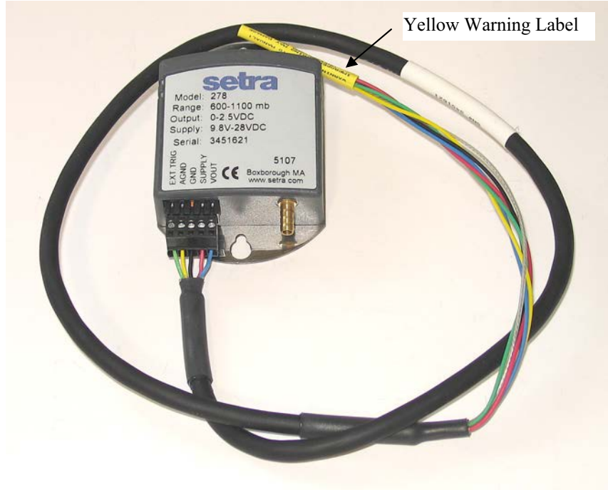
FIGURE 4-1. CS100 as Removed from the Box

Before connecting the barometer to the datalogger, a yellow warning label must be removed from the pigtails (see Figure 4-1). The warning label reminds the user of the importance of properly connecting the barometer to the datalogger. Proper wiring is shown in Table 4-1.