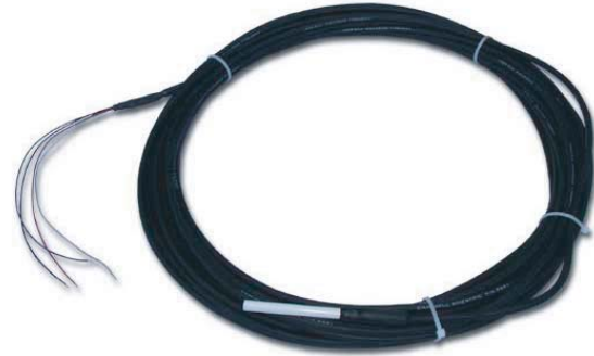
The 109 was developed specifically for the CR200(X)-series dataloggers. This probe outputs a signal of 0 to 2.2 volts.

The 109 is suitable for shallow burial only. Placement of the probe's cable inside a rugged conduit may be advisable for long cable runs—especially in locations subject to digging, mowing, traffic, use of power tools, or lightning strikes.